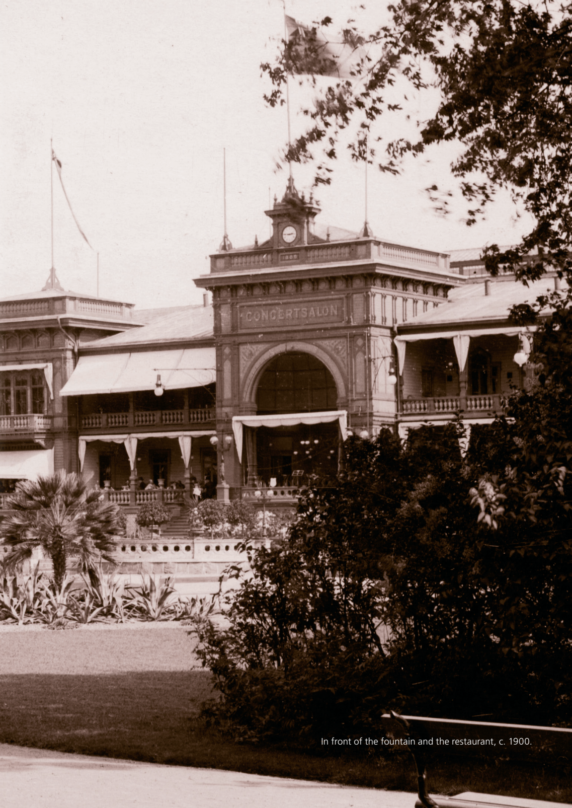
In front of the fountain and the restaurant, c. 1900.