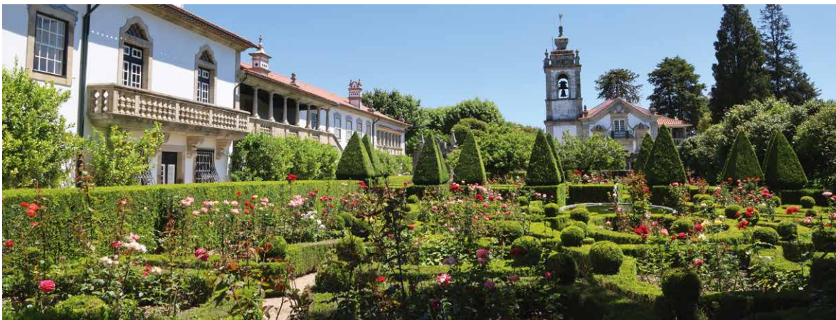
above: New community gardens