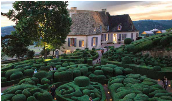
left: Candlelight evening (Les Jardins de Marqueyssac- Dordogne)

Boxwood still constitutes the gardens' main theme. They show great imagination and movement, at the expense of symmetry and regularity. These rolling characteristics and the sinuous paths give Marqueyssac softness and romanticism and the harmony with the landscape of Dordogne Valley.