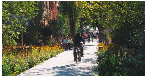
left: Parc de la Senne