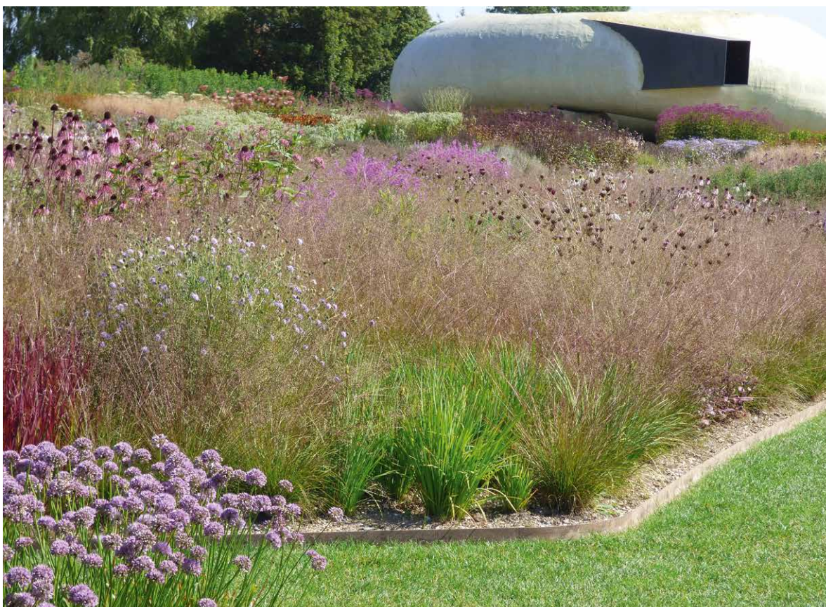
Garden by Piet Oudolf

The outer borders act as a frame and are planted with taller plants. Within this frame are seven borders, which are subtly block planted so that, at times, there seems to be a rhythmical display of velvety russet, for example. At other times, the eye might be drawn cleverly up the garden with a different variety of a plant, such as the butter yellow Achillea Hella Glashoff in the lower borders, and the deeper yellow Achillea Credo higher up.