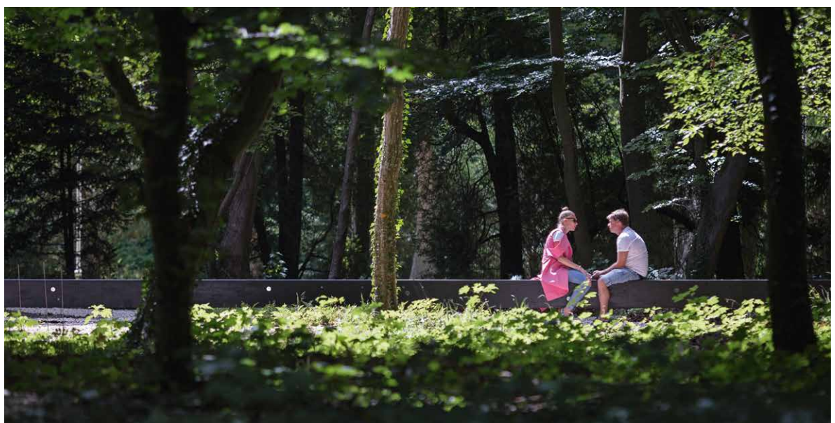
both photos: Impressions (Atelier eem; Paysarchitectures)