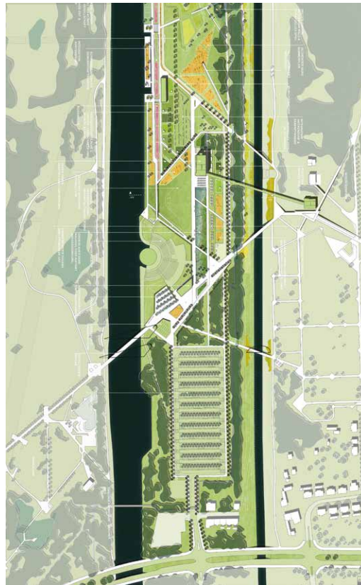
left: Development plan Zukunfts- insel East