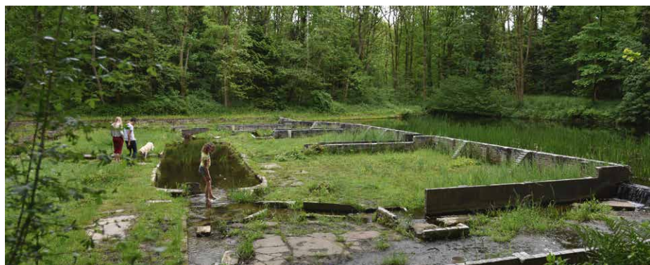
below: Waterloopbos Model Maasvlaktecentrale