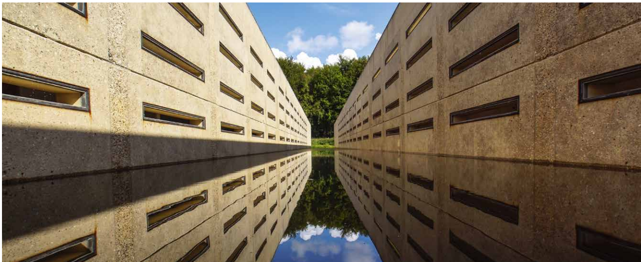
above: Waterloopbos, Deltawerk//

RAAAF and Atelier de Lyon have turned the biggest of these constructions, the massive Delta Gully, into the artwork Deltawerk//. The concrete structure, once in a strict line, is now broken. Concrete panels are cut from the sides, rotated and tilted. This offers a magical experience of light and dark, with views on the surrounding nature peeking through.