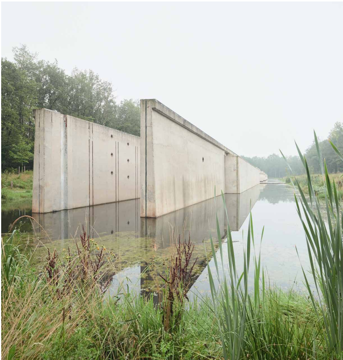
Deltawerk// (RAAAF)

The architectural intervention literally opened the forest for the public. The engineers that used to work in the laboratory are now guiding tours through the forest.