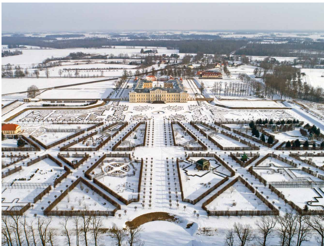
The Rundāle Palace Ensemble in winter.