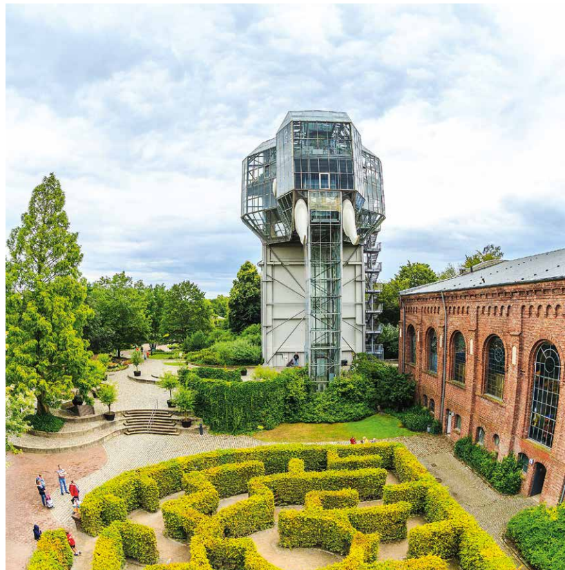
below: Maximilianpark Hamm: Glass elephant