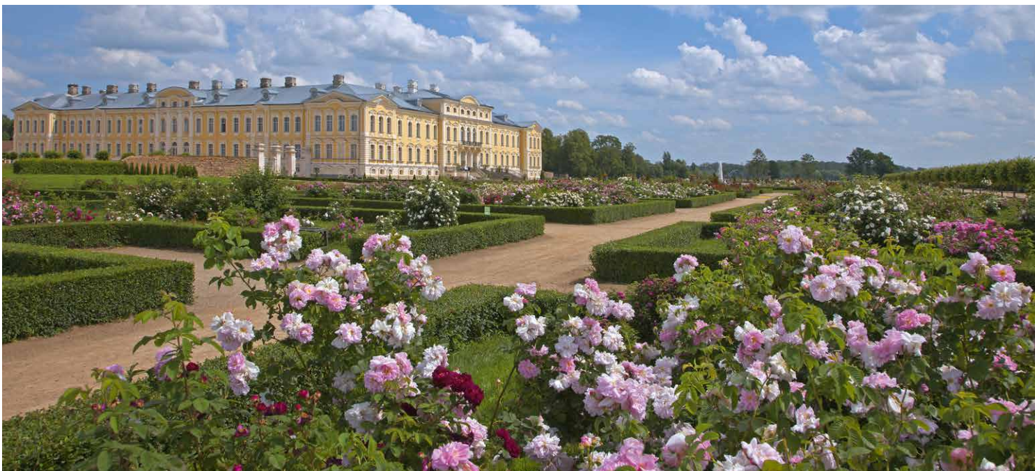
below: Rundāle Rose garden