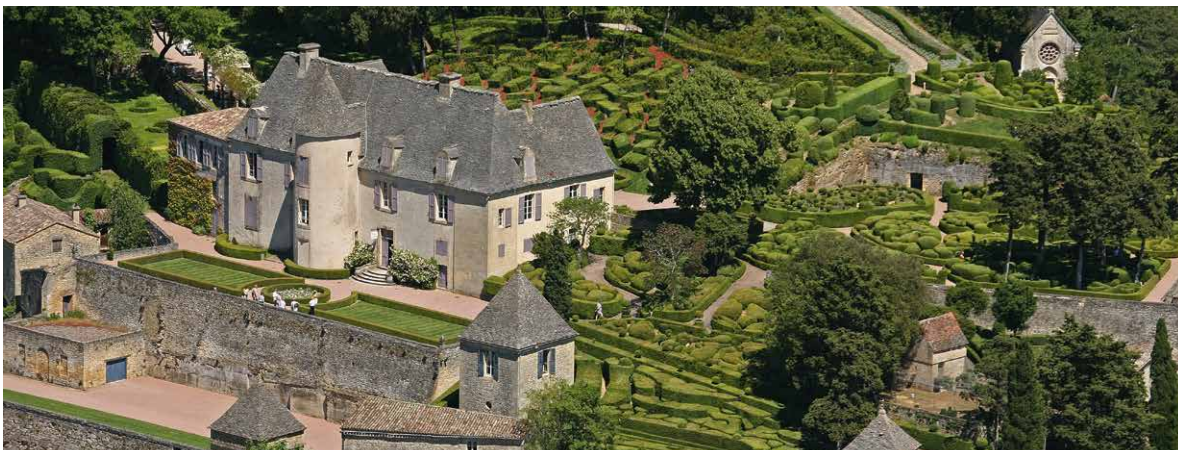
below: Aerial (Les Jardins de Marqueyssac-Dordogne)