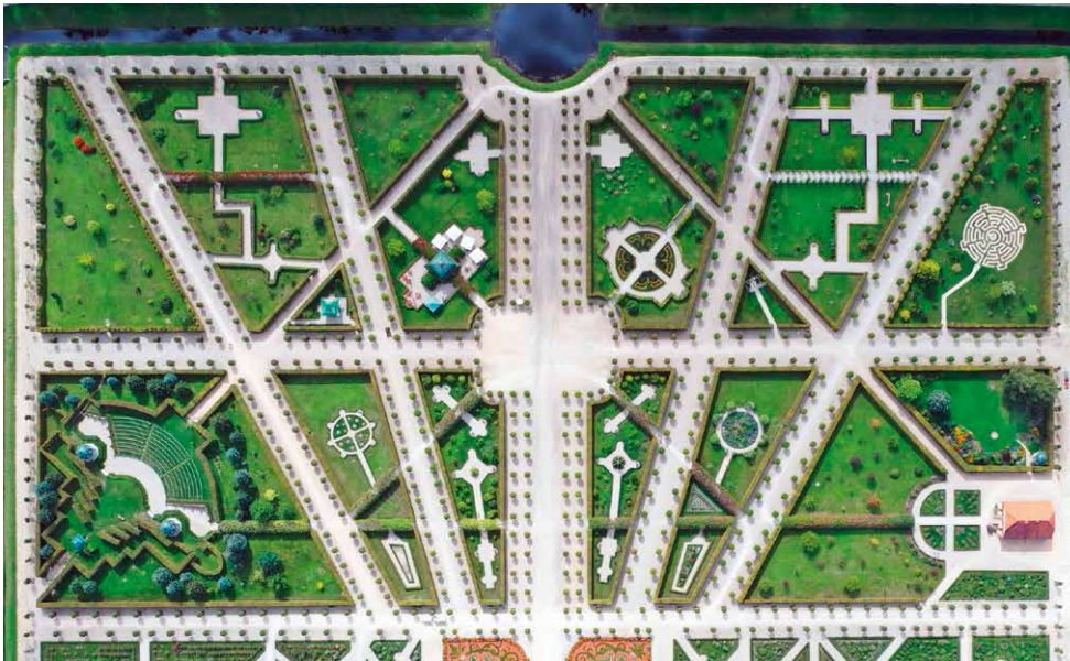
left: Bosquets of the regular park.

In 2004, the Green Theatre was opened. In 2005, the rose garden (1 ha) on both sides of the ornamental parterre was commenced. It contains 2,300 rose varieties, including 600 historical varieties. The restoration of fruit tree orchards commenced in 2018. Lists of plants used in the gardens and thematic exhibitions are shown in the Gardener's House.